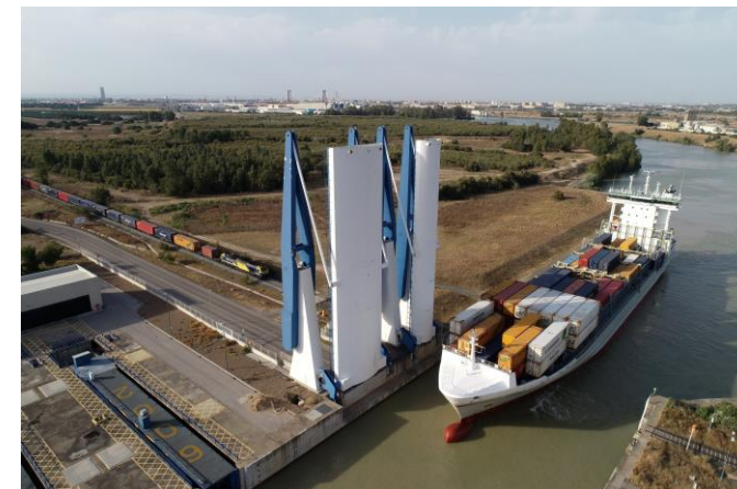
Seville Port and its innovative management center