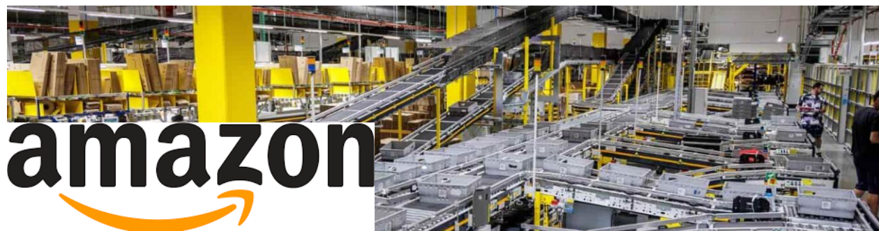
Amazon Dos Hermanas Logistics Center